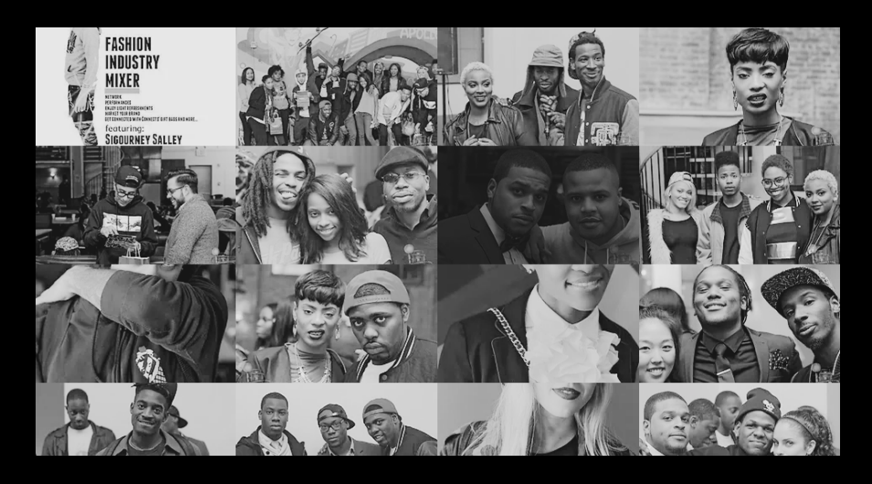
Fresh Like Us Fashion Networking w/ Sigourney Salley & cast of VH1's Black Ink Crew.