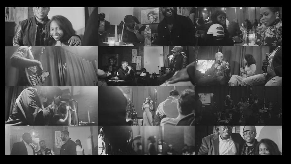
Keynote Conversation with Sway Calloway & Music Showcase.